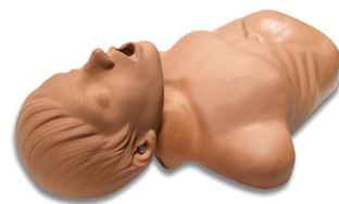
Trainer demo manikin Part# 8000-0835-01