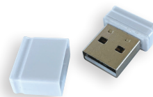
Trainer USB Software Upgrade Kit Part # 8028-000011-XX