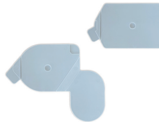
Trainer CPR Uni-padz electrode replacement liners Part# 8028-000013