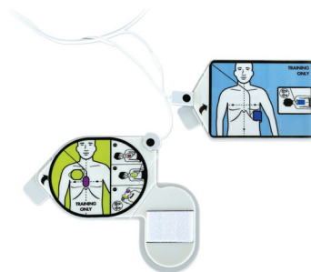
Trainer CPR Uni-padz ® electrode replacement adhesive gels Part# 8028-000012 (case of 5)

Replacements must be ordered separately.