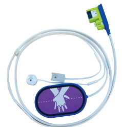
CPR Uni-padz electrode training harness Part# 8028-000010