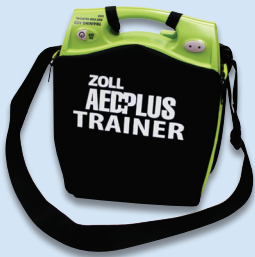
AED Plus Trainer Carry Case Part# 8000-0375-01