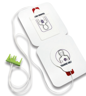
Pedi-padz® II Trainer Electrodes Part# 8900-000861-01 (case of 6)