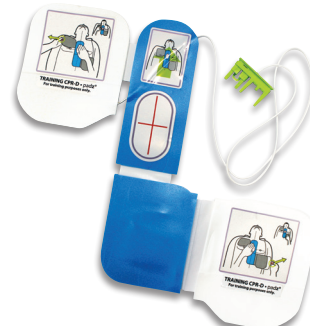
CPR-D-padz Trainer Electrodes Part# 8900-0804-01