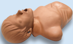
AED Plus Trainer Demo Manikin Part# 8000-0835-01