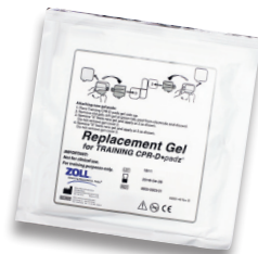
Replacement Adhesive Gels for CPR-D-padz Trainer Electrodes Part# 8900-0803-01

(Replacements must be ordered separately)