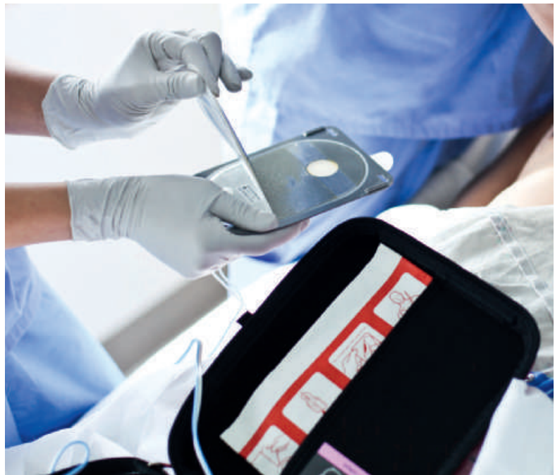
The HeartStart FR3 is small and light, which makes it easy to carry and maneuver in tight places.