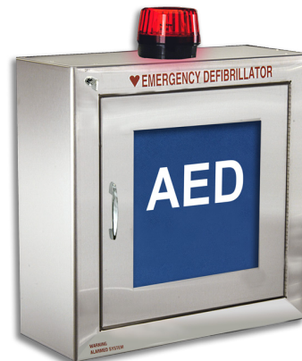
Flush-Mount Stainless Steel Cabinet with Built-in Strobe