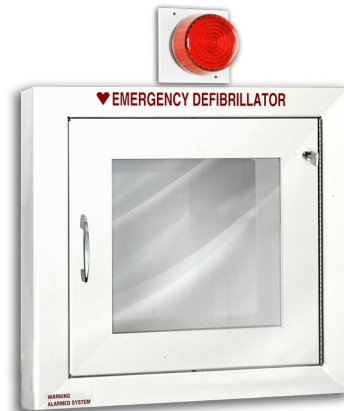
Semi-Recessed Mount Coated Steel Cabinet with Satellite Strobe