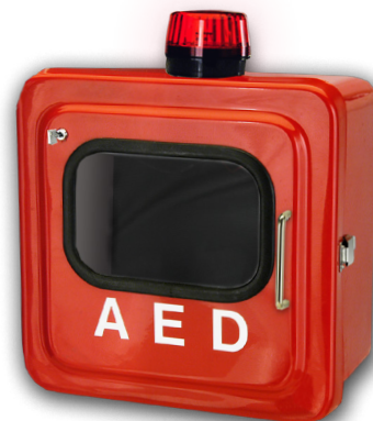
Flush Mount Fiberglass Cabinet with Built-in Strobe