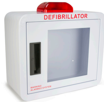
Flush-Mount Coated Steel Cabinet with Built-in Strobe